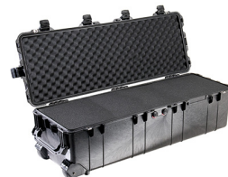
1740WF With Foam