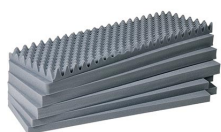
1741 6 pc. Replacement Foam Set