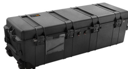
1740NF No Foam