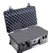
1510WF With Foam