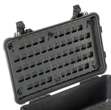
1510MP EZ-Click™ MOLLE Panel

c/ Provença, 388, Planta 7 • Barcelona, Spain 08025 • Phone: +34 934 674 999