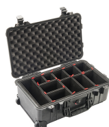
1510TP With TrekPak Divider System