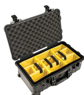
1514 With Padded Dividers