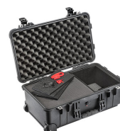
1510TPF TrekPak / Foam Hybrid