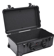
1510NF No Foam