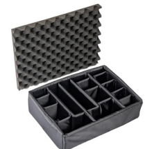
1525DS Padded Divider Set