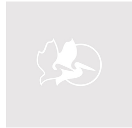
AL4824-1404RPFC With Foam, With Casters