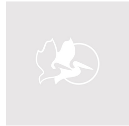
AL2624-1205RPFC With Foam, With Casters