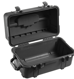
1460NF No Foam