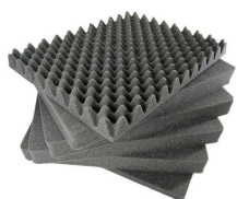
1461 6 pc. Replacement Foam Set