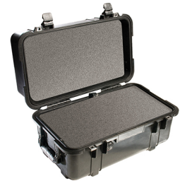
1460WF With Foam