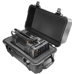
1460AALG With Custom Foam for 9430 / 9435