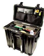
1446 Office Divider Set & Lid Organizer