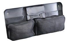
1449 Office Lid Organizer