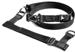
MSTRAP Micro Case Shoulder Strap