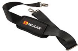
9487 Padded Shoulder Strap