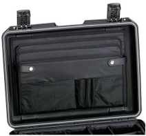
iM26XX-LIDORG Lid Organizer