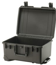
iM2620-X0000 No Foam