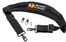
iM-STRAP-S-VER2 Padded Shoulder Strap