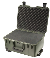
iM2620-X0001 With Foam