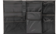
iM26XX-UTILITYORG Utility Organizer