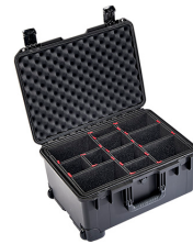
iM2620-X0006 With TrekPak Divider System