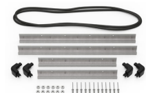
iM2620-M4-BEZEL Base Bezel Kit (Metric)