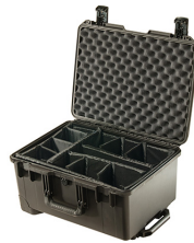
iM2620-X0002 With Padded Dividers