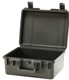
iM2450-X0000 No Foam