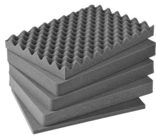
iM2450-FOAM 5 pc. Replacement Foam Set