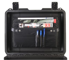
iM24XX-LIDORG Lid Organizer