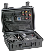
iM24XX-PHOTOPALLET Photography Pallet