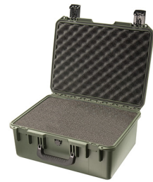
iM2450-X0001 With Foam