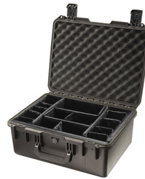
iM2450-X0002 With Padded Dividers