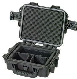
iM2050-X0002 With Padded Dividers