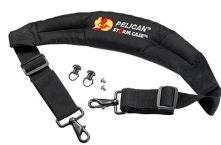
iM-STRAP-S-VER2 Padded Shoulder Strap