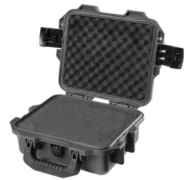
iM2050-X0001 With Foam