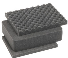
iM2050-FOAM 3 pc. Replacement Foam Set