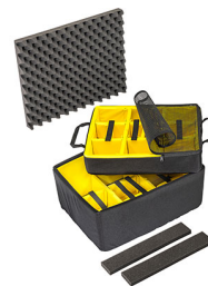
1607AirDS Padded Divider Set