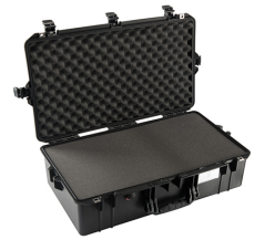
1605WF With Foam