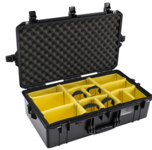
1605WD With Padded Dividers