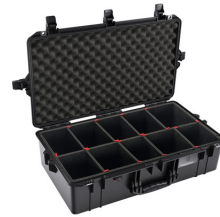
1605TP With TrekPak Divider System