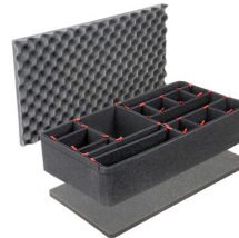
1605TPKIT TrekPak Case Divider Kit