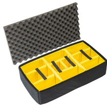
1605AirDS Padded Divider Set