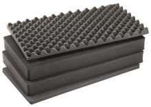
1605AirFS 4 pc. Replacement Foam Set