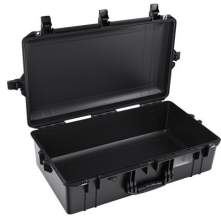
1605NF No Foam