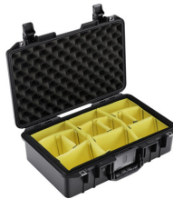
1485WD With Padded Dividers