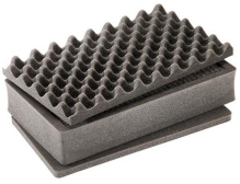
1485AirFS 3 pc. Replacement Foam Set