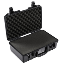
1485WF With Foam