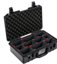
1485TP With TrekPak Divider System