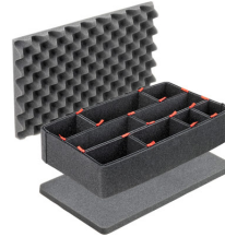
1485TPKIT TrekPak Case Divider Kit