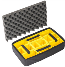
1485AirDS Padded Divider Set