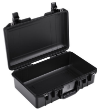
1485NF No Foam