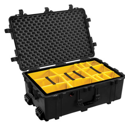
1654 With Padded Dividers