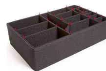
1650EUTP TrekPak Case Divider Kit