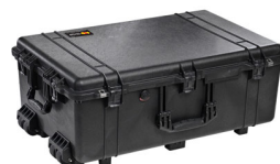
1650NF No Foam