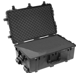
1650WF With Foam