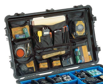
1659 Photo/Lid Organizer