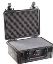
1150WF With Foam