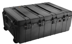
1730NF No Foam