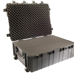
1730WF With Foam