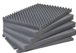
1731 5 pc. Replacement Foam Set