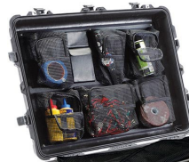
1639 Lid Organizer