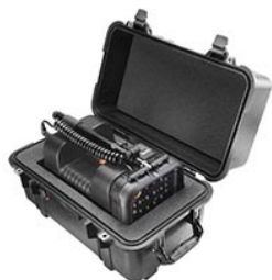
1460AALG 1460 Case with custom fit foam