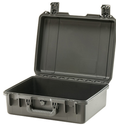
iM2400-X0000 No Foam