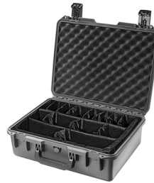
iM2400-X0002 With Padded Dividers