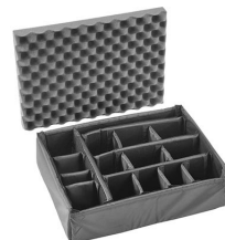
iM2400-DIV Padded Divider Set