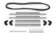
iM2400-M4-BEZEL-L Lid Bezel Kit (Metric)