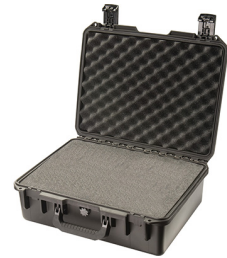
iM2400-X0001 With Foam