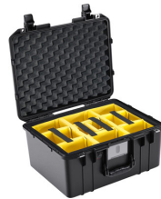
1557WD With Padded Dividers