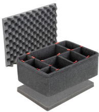
1557TPKIT TrekPak Case Divider Kit