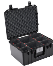
1557TP With TrekPak Divider System