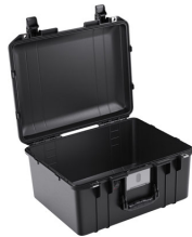
1557NF No Foam