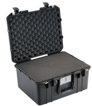
1557WF With Foam