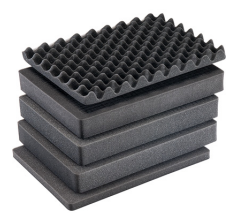
1557AirFS 3 pc. Replacement Foam Set