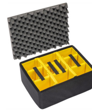
1557AirDS Padded Divider Set