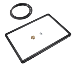
1520PF Special Application Panel Frame