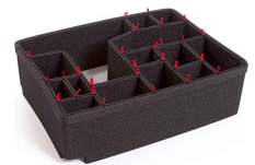
1560EUTP TrekPak Case Divider Kit