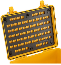
1560MP EZ-Click™ MOLLE Panel