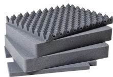
1561 4 pc. Replacement Foam Set