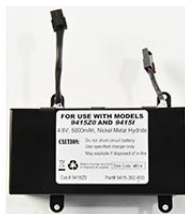
941820 Replacement Battery