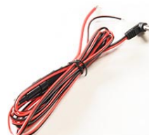
6061F Direct Wiring Rig for Fast Charger