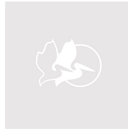
9438S Universal Charger