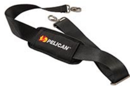
9487 Padded Shoulder Strap