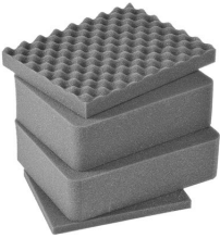
iM2075-FOAM 4 pc. Replacement Foam Set