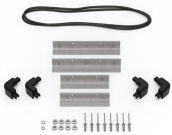
iM20XX-M4-BEZEL Base Bezel Kit (Metric)