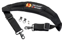
iM-STRAP-S-VER2 Padded Shoulder Strap