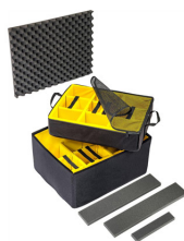
1637AirDS Padded Divider Set