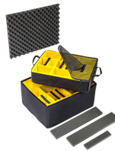
1637AirDS Padded Divider Set