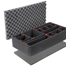
1605TPKIT TrekPak Case Divider Kit