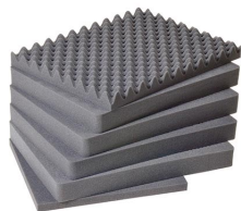
1621 6 pc. Replacement Foam Set