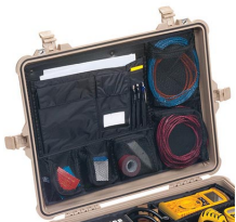
1609 Lid Organizer