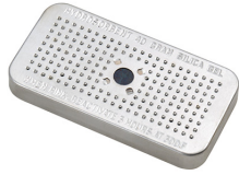
1500D Desiccant Silica Gel