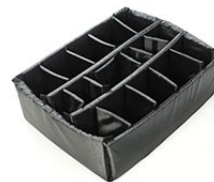
1625 Padded Divider Set