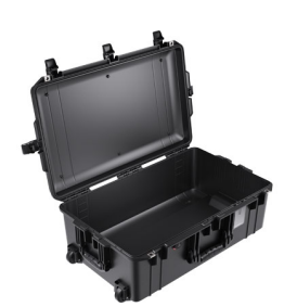
1595NF No Foam