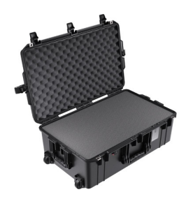
1595WF With Foam