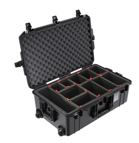
1595TP With TrekPak Divider System