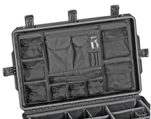
iM2875-UTILITYORG Utility Organizer