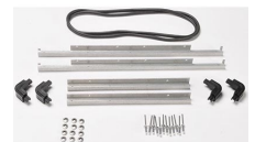
iM27XX-M4-BEZEL-L Lid Bezel (Metric)