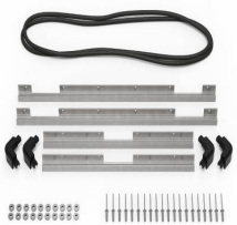
iM2700-M4-BEZEL-L Lid Bezel (Metric)