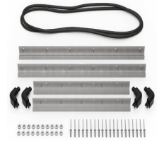
iM2700-MBEZ-B Base Bezel (Metric)