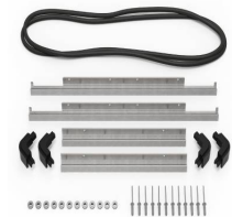
iM2600-M4-BEZEL-L Lid Bezel (Metric)