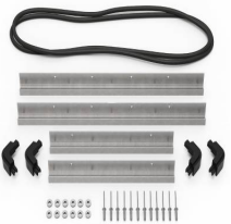
iM2600-MBEZ-B Base Bezel (Metric)