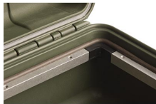
iM24XX-BEZEL Base Bezel Kit