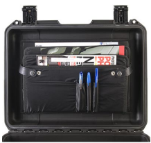
iM24XX-LIDORG Lid Organizer