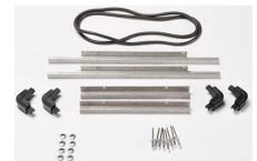
iM2306-M4-BEZEL-L Lid Bezel (Metric)