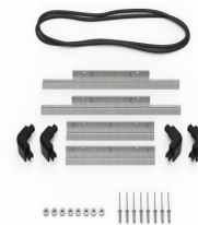
iM2200-M4-BEZEL-L Lid Bezel (Metric)