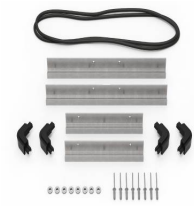
iM2200-MBEZ-B Base Bezel (Metric)