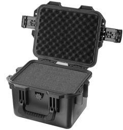
iM2075-X0001 With Foam