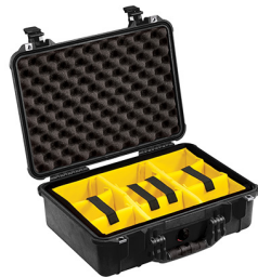
1504 With Padded Dividers