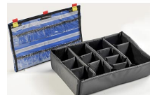
1505EMS EMS Accessory Set (Lid Organizer and Divider Set)