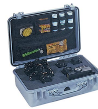
1508 Photographer's Lid Organizer