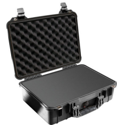
1500WF With Foam