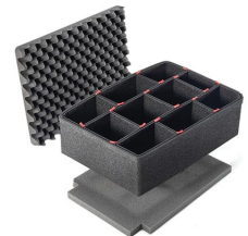
1500TPKIT TrekPak Case Divider Kit