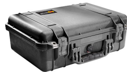
1500NF No Foam