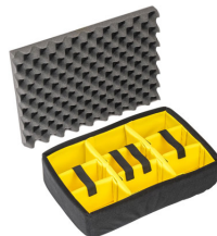
1505 Padded Divider Set