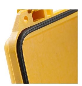
1783 Replacement O-ring