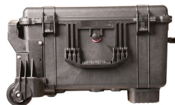
1620MNF No Foam