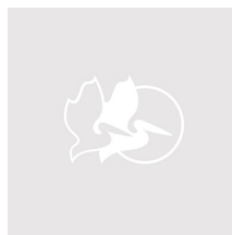
472-PWC-DW3100-OD-BLK Green Case With Black Soft Case