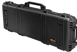
1720NF No Foam