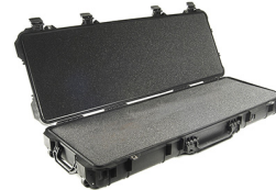
1720WF With Foam