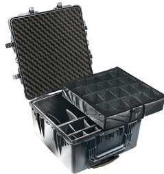
1644 With Padded Dividers