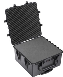
1640WF With Foam