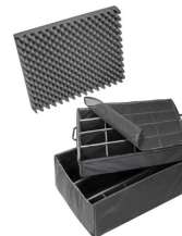
1645 Padded Divider Set