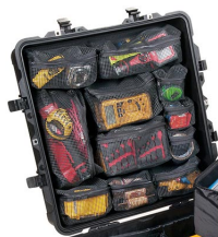
0379 Lid Organizer