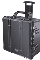
1640NF No Foam