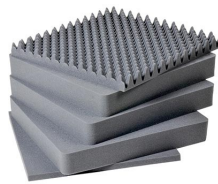
1641 5 pc. Replacement Foam Set