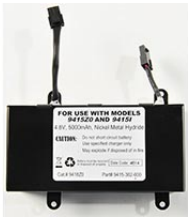
941820 Replacement Battery