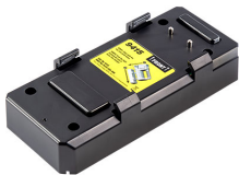
9416 Deck/Dash Charger Base Unit