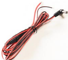
6061F Direct Wiring Rig for Fast Charger