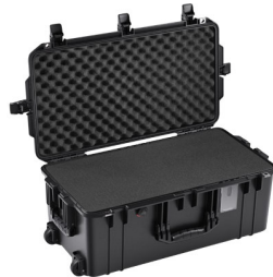
1606WF With Foam