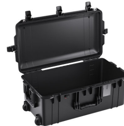
1606NF No Foam