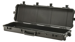
iM3300-X0000 No Foam