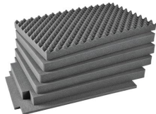
iM2950-FOAM 6 pc. Replacement Foam Set