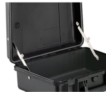
iM-LIDSTAY Lid Stay