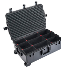
iM2950-X0006 With TrekPak Divider System