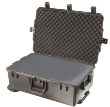
iM2950-X0001 With Foam