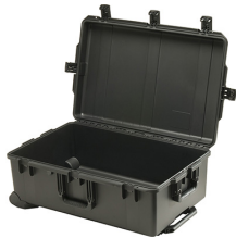
iM2950-X0000 No Foam