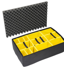
iM2950-DIV Padded Divider Set