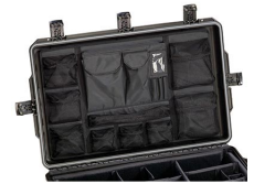
iM29XX-UTILITYORG Utility Organizer